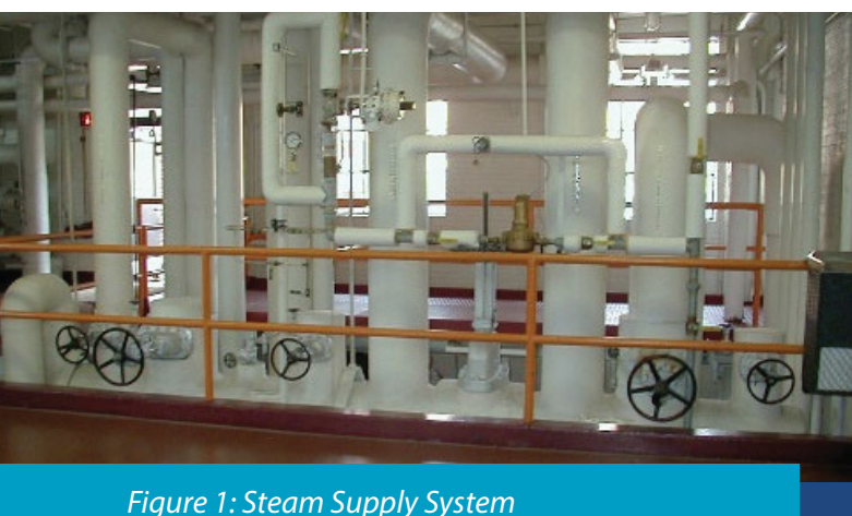
Figure 1: Steam Supply System