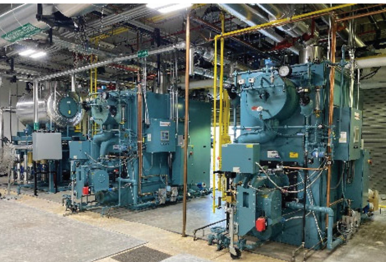
Figure 2: Boiler Plant

One of the biggest mistakes that the writing team can make when writing the SOP is assuming that the team members executing the tasks are familiar with each task, its steps, or even a concept that is not documented or defined in the SOP. Thinking that an employee who has been working with the steam system for 22 years knows how to accomplish the task correctly and safely is the wrong approach.