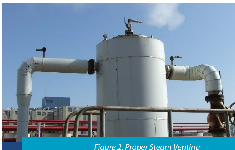
Figure 2: Proper Steam Venting