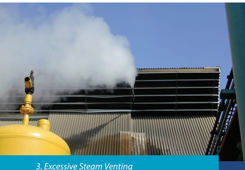
3. Excessive Steam Venting