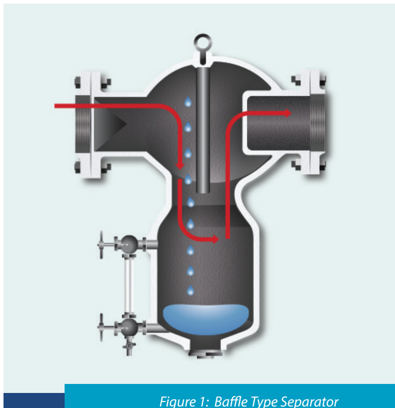
Figure 1: Baffle Type Separator

(control valve or steam trap station). The efficiency of baffle separators is lower than the other types of separators.