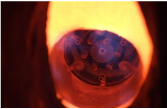
Figure 2: Combustion Process

Equipment that measures oxygen is more precise than carbon dioxide measuring devices. The other crucial measurement is carbon monoxide (CO) measured in ppm (parts per million). Information from the combustion analysis equipment is used to calibrate the settings on the air and fuel supply systems for the combustion process.