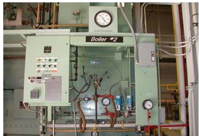
Figure 3: Natural Gas/Fuel Oil Burner